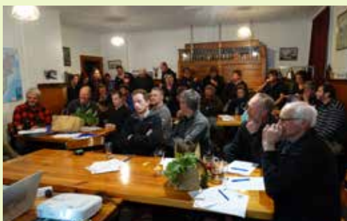
Waihao Forks Hotel