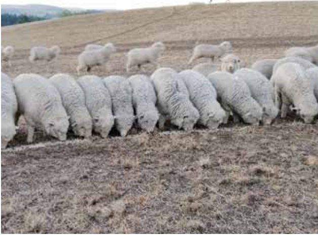
Sheep eating barley and nuts