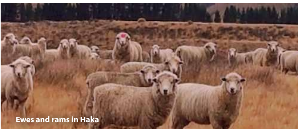
Ewes and rams in Haka

Vitamin D increases the absorption of Calcium from the diet and helps with bone and kidney mechanisms to do with calcium regulation. Some forms are derived from sun light, other forms from certain feeds. Vitamin D is lowest in the winter when sunshine hours are lower. Mid-winter shearing has shown to reduce the risk of bearings in multiple bearing ewes. Is this because their skin is exposed to more sun light and more vitamin D? We assumed it had something to do with increased metabolism, burning abdominal fat and moving around more. Perhaps it is both. If you are a bearing risk farm you could try injecting your twinning and triplet ewes with Vitamin ADE after scanning.