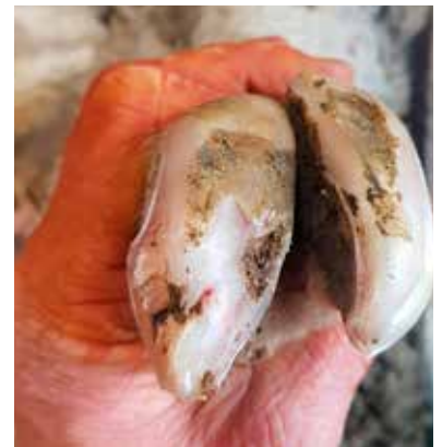
Has this healed? Needs that crack cleaned out a bit more to be sure

We can get in the recognised wetting agent SLS on request. It comes in 20L containers, using 1-2L per 100L solution. Don't ask me about the efficacy of all the other wetting agents in your HAZCHEM 2 shed...I have no idea about their appropriateness, efficacy or residues. We also stock hydrometers.