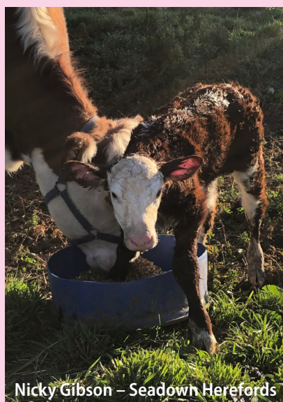
Nicky Gibson – Seadown Herefords

The physical size of yearling and 2 year-old bulls is important, but will not tell you the calving ease or birth weights of progeny. For heifers a live calf and a healthy 1st calvers are the top priority, but it can be interesting to check the make-up of other traits on heifer-mating bulls. Check the breeding values for calving ease: Birth weight, Calving ease direct, gestation length of the heifer bulls you intend to use. Look also at the accuracies and what the sire of the bull is made up of also.