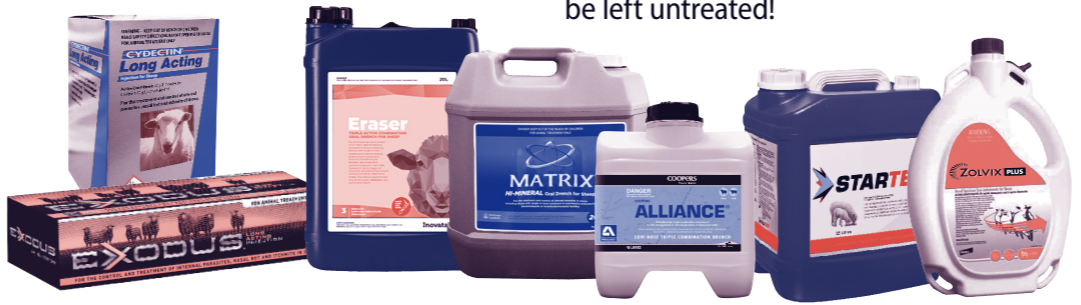
Long Acting Injection Triple Active Novel Active

Ewes carrying multiples eating close to the ground on a tight winter feed budget can get significant advantages using long acting worm control. But a fat crossbred ewe carrying a single lamb, and not under feed pressure may be left untreated!