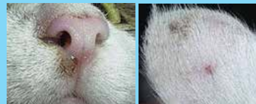
Early squamous cell carcinomas on a cat's nose and ear