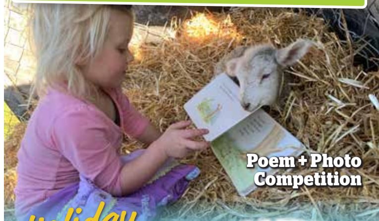
Poem + Photo Competition